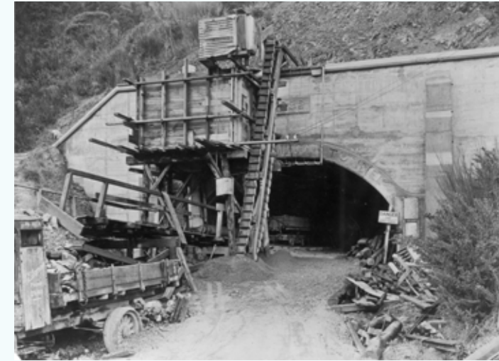
Wainuiomata tunnel under construction, 1932

Since the tunnel was completed, telecommunications cables and a Hutt City Council sewer pipe have also been laid through it.